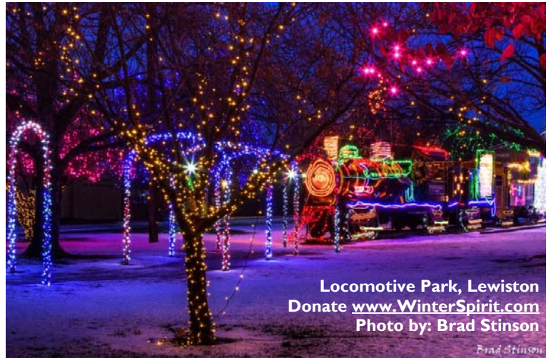
Locomotive Park, Lewiston Donate www.WinterSpirit.com